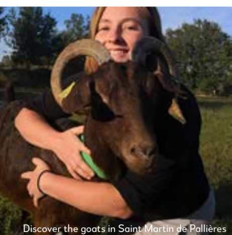
Discover the goats in Saint-Martin de Pallières