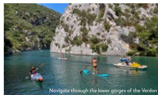
Navigate through the lower gorges of the Verdon